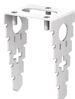
Anchor basket DS-15219